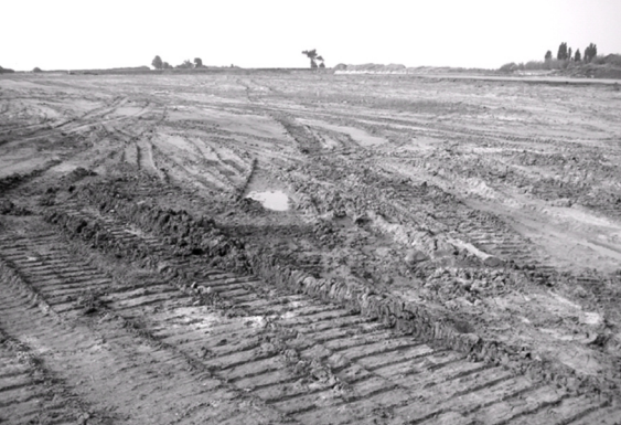
ECONOMIC RESEARCH ASS., MAIN OFFICE, LA, 2004