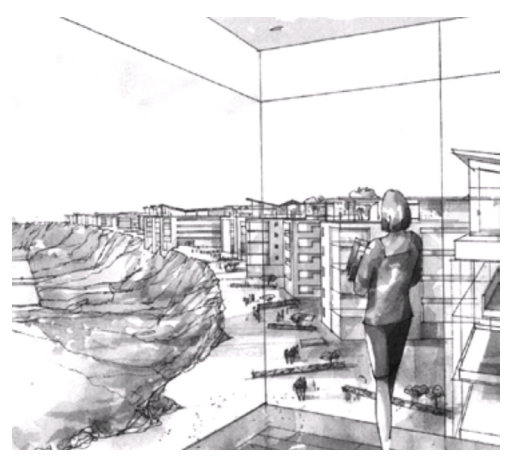
Architectural proposal, Kalkbrottet, South Malmö (Unsigned drawing in «The developer's dream come true...», folder, published by Heidelberg Cement, 2003)

The second type of influence, the transferable discourse, is brought in by the research team itself, and can be illustrated by the interest in exploiting open green spaces and recreation areas south of Malmö, where protests and actions against the local government of the City of Malmö (and its decision to let this area be turned into an area for housing and business) have taken place recently. This process may be analysed, and perhaps influenced, by a similar discourse in Los Angeles. Over a period of thirty years, a wetland area, Ballona Wetlands, in the southern part of the City of Los Angeles has been the subject of architectural suggestions (and protests), initially dominated by proposals in the spirit of New Urbanism, and later to be concretely manifested — as a simplified version of this current — in large scale housing developments known as the Playa Vista area.