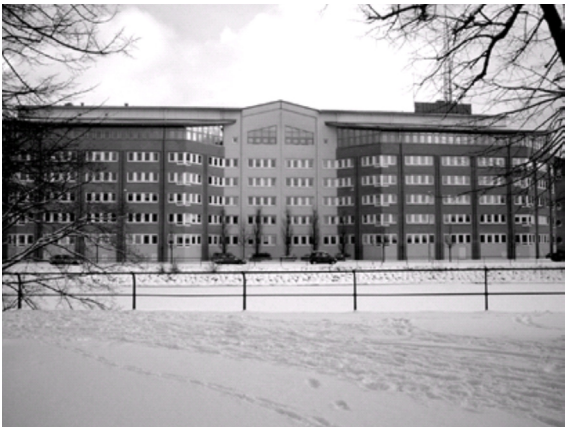
Police HQ Los Angeles, 2004